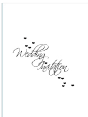
Modern Script Design

Tapestry effect board in white with silver detail and silver embossed text in a traditional script style.